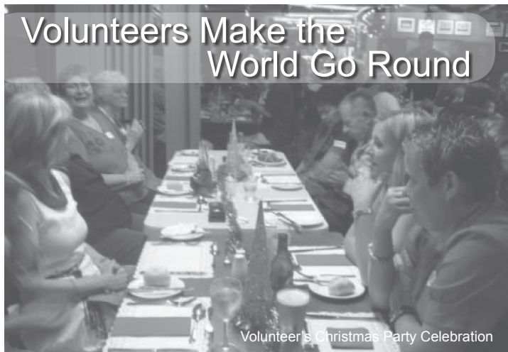
Volunteers Make the World Go Round

Our Mission "Enable and encourage individuals and families to take informed control of their own lives, and together enrich our community."